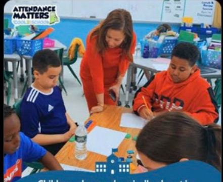
Children who are chronically absent in kindergarten and 1st grade are less likely to be reading on their grade level by 3rd grade.

#DidYouKnow? Children who are chronically absent in kindergarten and first grade are less likely to be reading on their grade level by the third grade. It is clear that #AttendanceMattersRI.